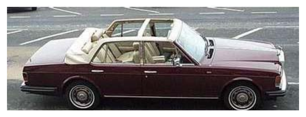
Only the Americans could do this to a Silver Spirit!

An octane selector is fitted to enable one to adjust the ignition timing to suit low octane rated fuels. The octane selector is initially set in the fully advanced (W not '0') position to suit 95 or 100 octane fuels for 8:1 and 9:1 compression ratios respectively, For lower rated fuel the lock-nut should be released and the eccentric pin should be turned anti-clockwise retarding the ignition until a satisfactory performance is obtained.